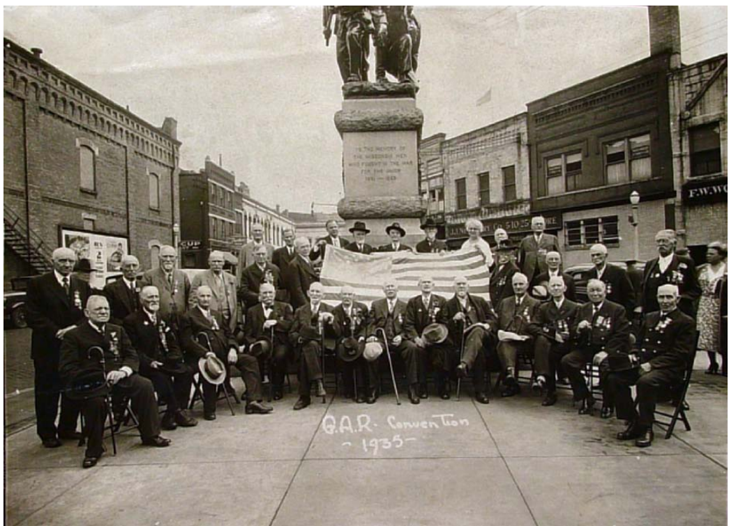
To the right is a photo of the 1935 Wisconsin GAR Encampment in Beloit.

It's time to think about ordering your 2013 National Encampment badge – it will be here before you know it. The form is to the left. It symbolizes the mascot of the 8 th Wisconsin Infantry with Old Abe the War eagle, the years from the last National Encampment in Wisconsin (1943), and the G.A.R.