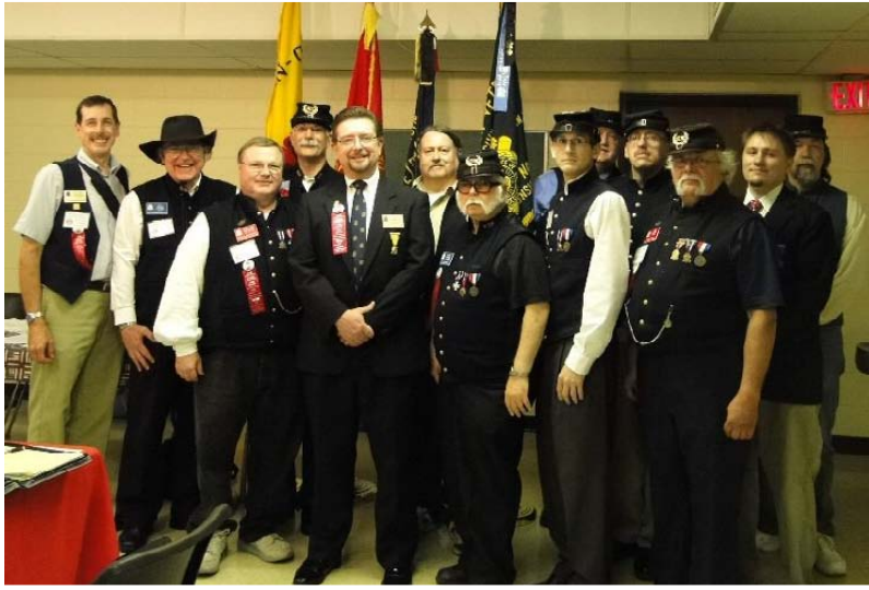
Left, Camp #1 at the Encampment