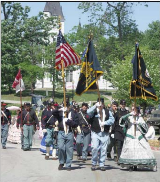
Members of Camp #1 and Auxiliary #4 march at the Remembering Our Heritage event at the Soldiers Home in Milwaukee