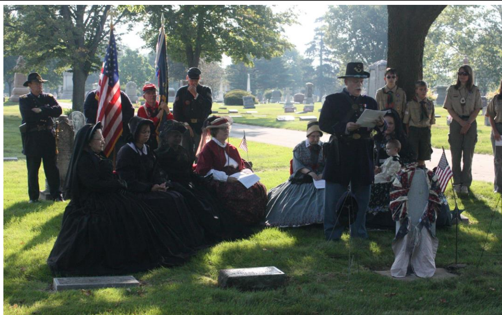
Photos are of Camp #4 doing a headstone dedication in Waukesha last fall.