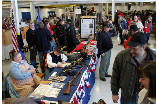
Our Camp display was set up again next to Company E, 2 nd Wisconsin.

The crowds were steady and we did make some good new contacts for possible membership.