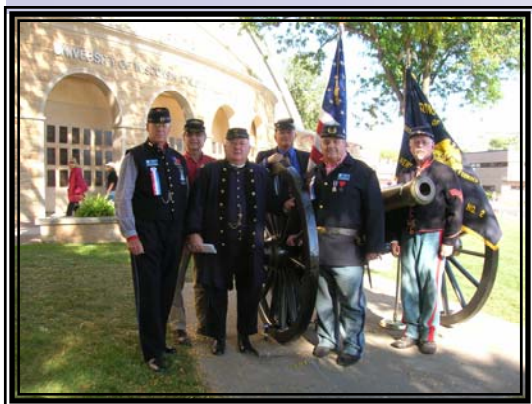
Restored Civil War Cannon and GAR Arch located at Camp Randall Memorial Park, Madison WI