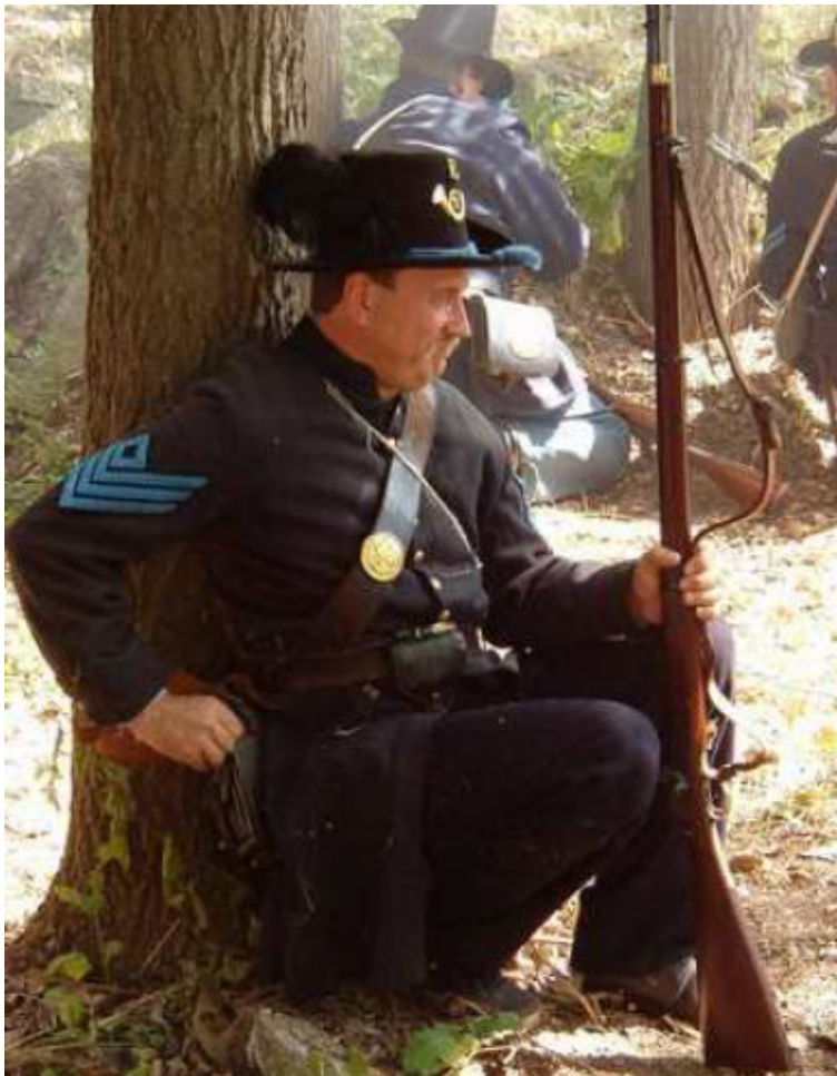
Photo from the Second Wisconsin Infantry website and article from Kirby Scott's Camp #8 "Camp Orders".