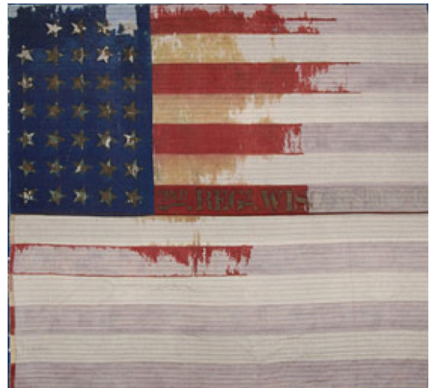
Preserved remnant of the handmade 2 nd Wis. Vol. Inf. flag, made in Madison and presented to the regiment as they left for Washington D.C