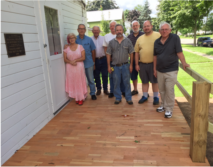
Attendance at our 20 Aug meeting