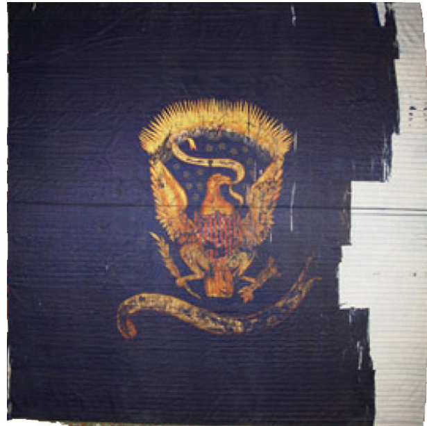
Preserved remnant of the 2 nd Wis.Vol. Inf. regimental flag, also hand made in Madison

The regimental flags of the Union were generally blue with some sort of emblem and scroll to indicate the name of the unit. Again these were 72x72 inches and made of silk.