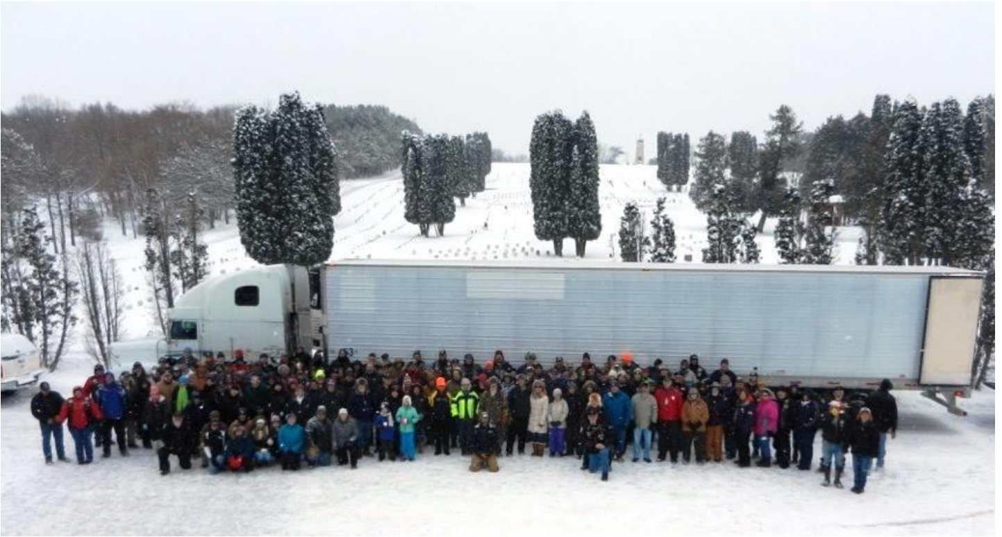
Group photo before laying wreaths