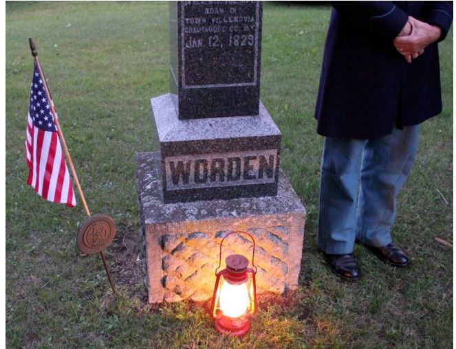
Above and below are pictures from the Saturday evening cemetery ghost walk in Weyauwega, WI.