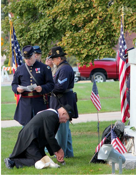
Friday evening Old Abe Camp #8 & Auxiliary participated in a wreath ceremony at the George W. Taggart monument in Weyauwega, WI.

On September 20 th & 21 st in Weyauwega, WI Old Abe Camp #8 & Auxiliary did a living history, conducted a wreath presentation, participated in a parade, and had a cemetery ghost walk.