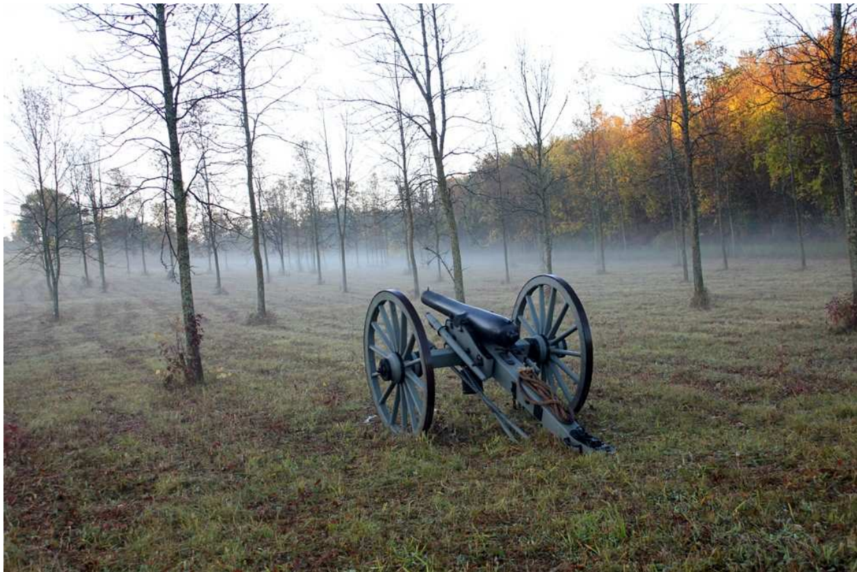
Sunday morning battlefield fog at Wade House.

Please send $40.00 to the Camp Secretary: Alan Petit E7602 Cutoff Road New London, WI 54961