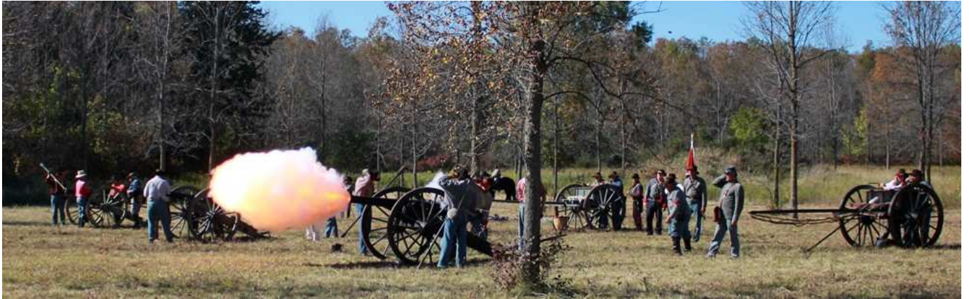
Sunday afternoon battle pictures. Some Old Abe Camp #8 members were helping with the Confederate cannon crew.