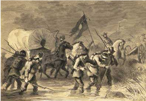
The defeated Confederate Army (under the command of General Robert E. Lee) retreats from the battlefield after the Battle of Gettysburg, July 4, 1863.

Much has been written about the Three day Battle of Gettysburg, but the entire campaign lasted from the first days of June through near the end of July.