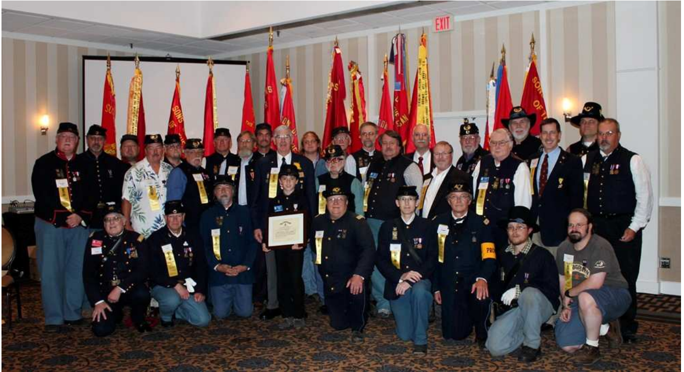
Department of Wisconsin Brothers pose for a group photo during the Saturday events of the National Encampment.