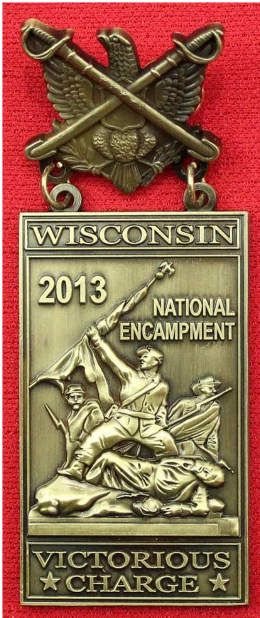
The 2013 National Encampment Medal.

The National Encampment for 2016 will be held in Springfield, Illinois marking the 150 th anniversary of the founding of the Grand Army of the Republic.