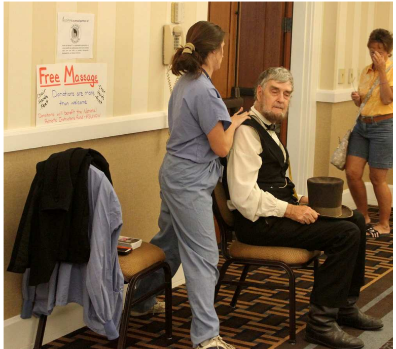
Free massages were available at the Encampment. Even President Lincoln had one!