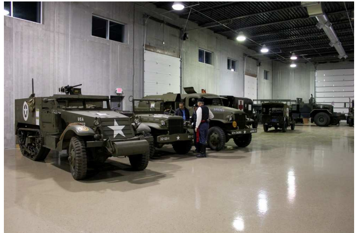
Some of the vehicles in the motor pool building.