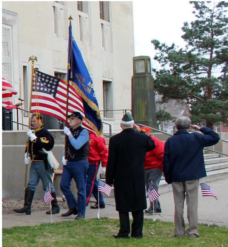
Camp 8 color guard.