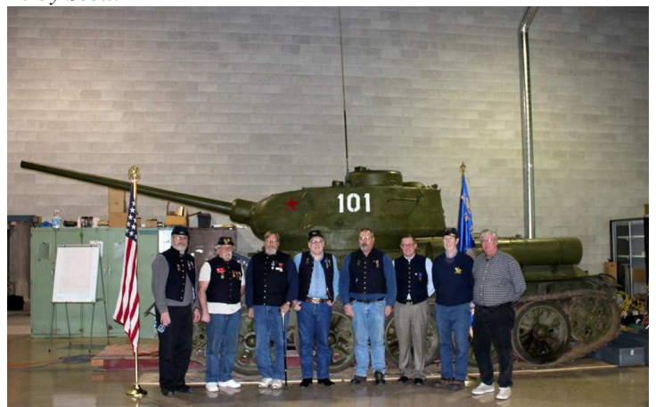
Camp members pose in front of a Soviet T-34/85 Tank in the motor pool building.