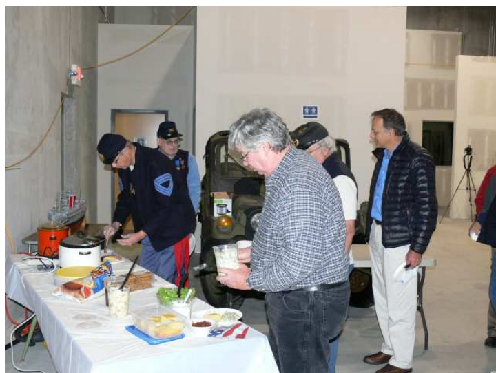
Traditional bean supper was enjoyed by all.