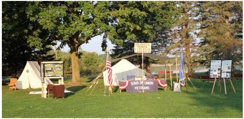
Another good looking Camp 8 display!

Recently, the flag underwent muchneeded conservation treatment, generously supported in part by the Sons of Union Veterans Old Abe Camp #8, and will be on display this November as part of the Museum's fall exhibit, <u>Outstanding Objects: The</u> Oshcar Awards.