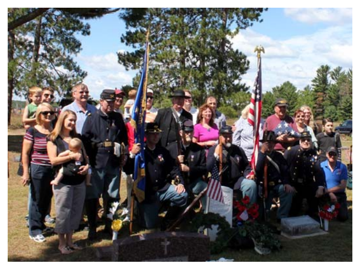
Members of Camp 8 with the family, and members of the local American Legion.

After the ceremony the family hosted a social at the American Legion hall which included soft drinks and desserts. The family donated $150 to Camp 8 in appreciation for their traveling to Wausaukee to perform the dedication.