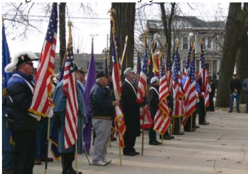
Veterans unit color bearers, students from St Francis Cabrini school, and about two hundred citizens attended.

"It's difficult to imagine what the United States would be like if we did not have in our midst those who were willing to fight to protect our freedoms. Indeed, this country has been blessed by generations of brave men and women who unhesitatingly sacrificed—even their lives—so that their fellow Americans might continue to enjoy the fruits of