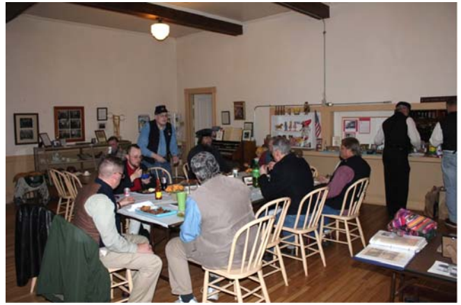
The annual bean supper, always makes for a nice evening of fellowship.