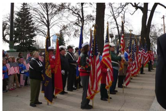
Veterans & Patriotic groups participate in the 2010 Veterans Day ceremony, Oshkosh.

date commemorates the armistice that was signed by the Allies and Germany and that took effect at the "eleventh hour of the eleventh day of the eleventh month" of 1918. In 1954, the name was changed to "Veterans Day" to honor American veterans of all wars.