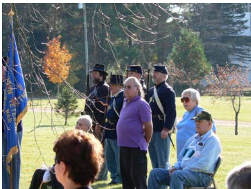
Tribal elders who are also veterans fell in next to the Camp 8 musket squad and color bearers during the ceremony.