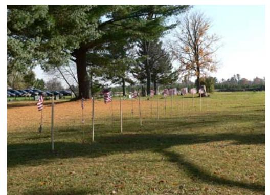
The graves of Mohican Civil War veterans, unmarked except for the presence of GAR flag holders.