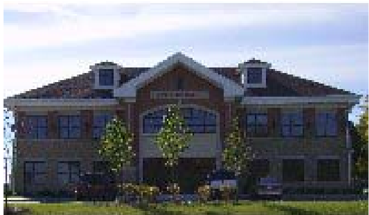
Citizens Bank of Mukwonago Waukesha Branch